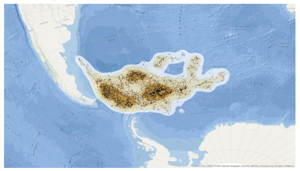
Figure 2. Main foraging areas (derived from Kernel density estimation) of macaroni penguins breeding at Bird Island, South Georgia (data provided by BAS). White-orange gradient correspond to increasing utilization of the areas by the penguins (black dots represent the original positions derived from the tracking devices).

The analyse of all available tracking data to define candidate sites for special protection will be undertaken once the new database is populated with data from contributing scientists. Preliminary analyses have already been undertaken for some of the datasets already submitted and initial testing of BirdLife marine IBA approaches have proved positive.